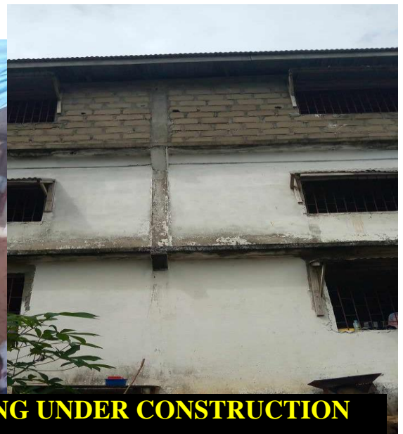
HDYFF STUDENTS & SCHOOL BUILDING UNDER CONSTRUCTION